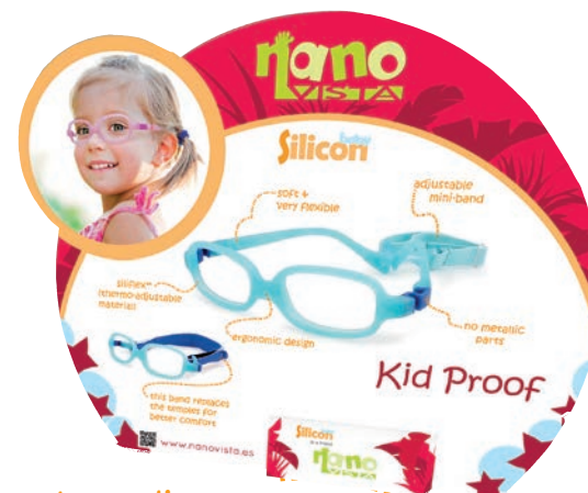
flyers dispenser ref. NV8EN