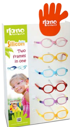
display 6 frames ref. NAO12