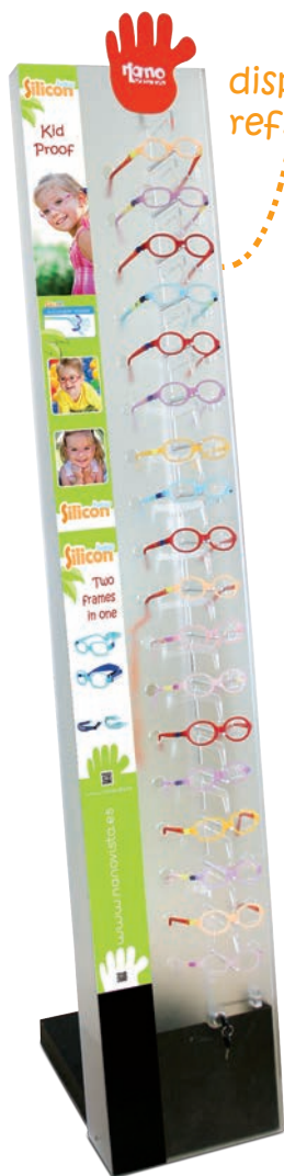
display 18 frames ref. NAO11