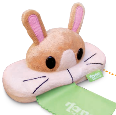
new case with rabbit form